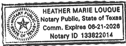
Notary Public for the State of Texas

SUBSCRIBED AND SWORN TO BEFORE ME on this 2 nd day of February, 2024.