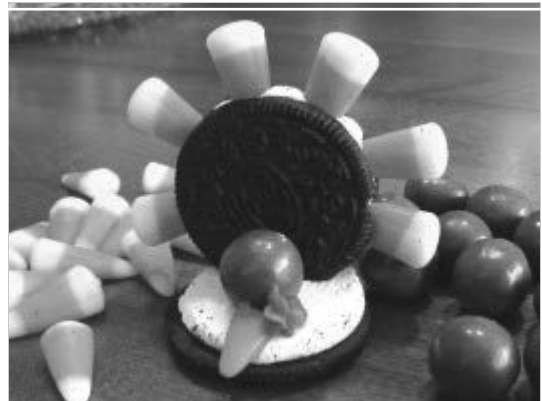
Ingredients for each Oreo Turkey

If you purchased your property during 2014 you should file your exemption affidavit before April 30, 2015.